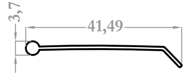
8112 0,130 kg/m